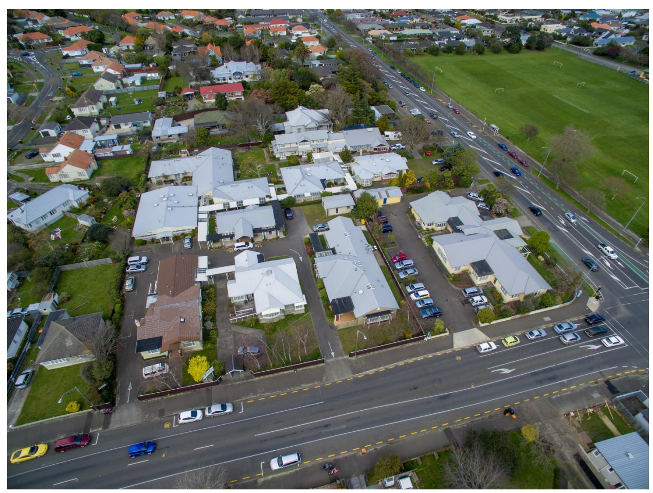
Aerial view Ozanam House, Featherston Street, Ruahine Street, 2017

Once again our benefactors have been extremely generous. In addition to donations of $156,129, bequests of $385,123 were received. We enjoyed the goodwill and support of our local authorities. The Trust benefits from a rates remission from the Palmerston North City Council and Horizons Regional Council of $21,069 / LY $18,391 respectively, this support is much appreciated.