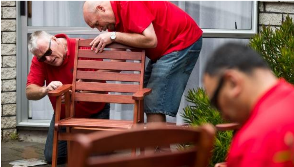
Bunning staff assembling outdoor furniture donated to Ozanam House by Bunnings.

Once again our benefactors have been extremely generous. In addition to donations of $204,951, bequests of $90,031 were received. We enjoyed the goodwill and support of our local authorities. The Trust benefits from a rates remission from the Palmerston North City Council and Horizons Regional Council of $18,391 / LY $22,823 which is appreciated.