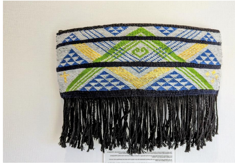
"Te Whiri Pāraharaha" (Three Plait) This piece of Māori taniko artwork presented to Ozanam House represents the regions of Taranaki, Whanganui, and Hawkes Bay where people travel from to receive cancer treatment in Palmerston North.

This piece of Māori taniko artwork presented to Ozanam House represents the regions of Taranaki, Whanganui and Hawkes Bay where people travel from to receive cancer treatment in Palmerston North.